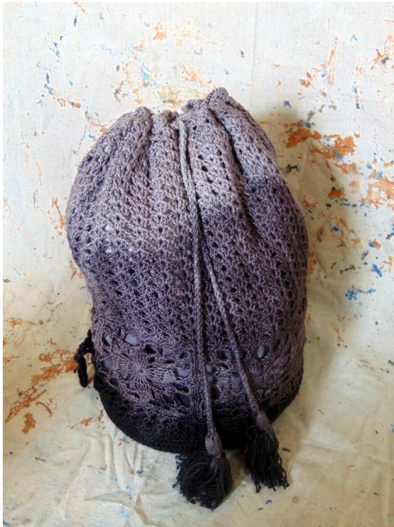
The finished bag

This pattern is for non-commercial use only. For any questions or comments please contact me at info@princesstafadzwa.com .